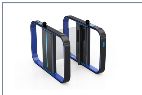
LA3220-B-R/L Single Channel