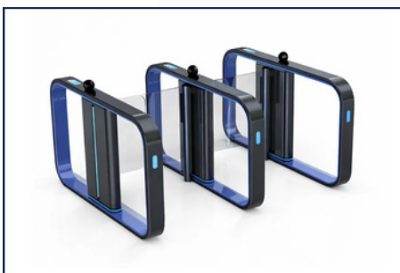
LA3220-B-R/L/M Two Channel