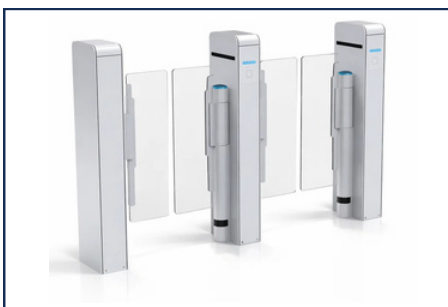
LA3219S-R/L/M Two Channel