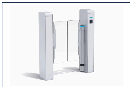
LA3219S-R/L Single Channel