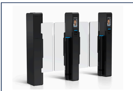
LA3219H-R/L/M Two Channel