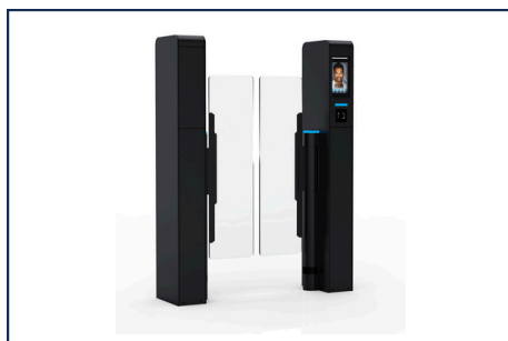
LA3219H-R/L Single Channel