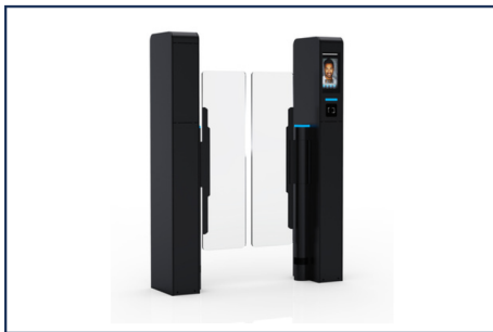
LA3219H-R/L Single Channel