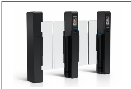
LA3219H-R/L/M Two Channel