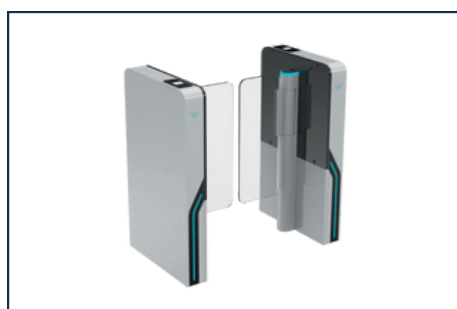
EF3213-1-R/L Single Channel