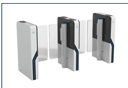
EF3213-2-R/L/M Two Channel