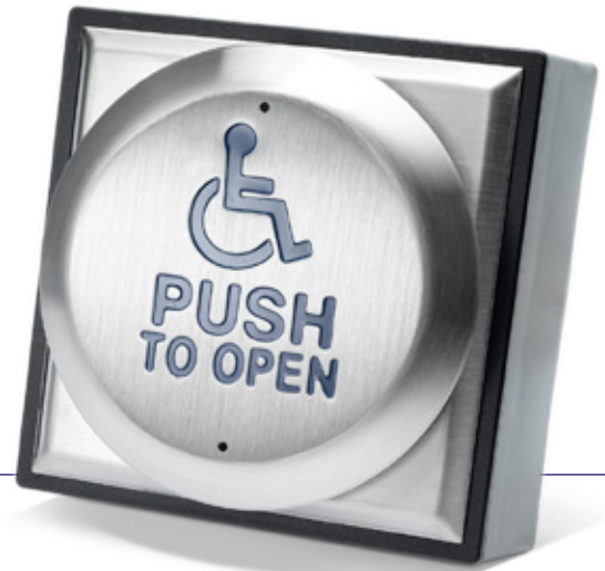
DDA900-1 PUSH TO OPEN / WHEELCHAIR SYMBOL